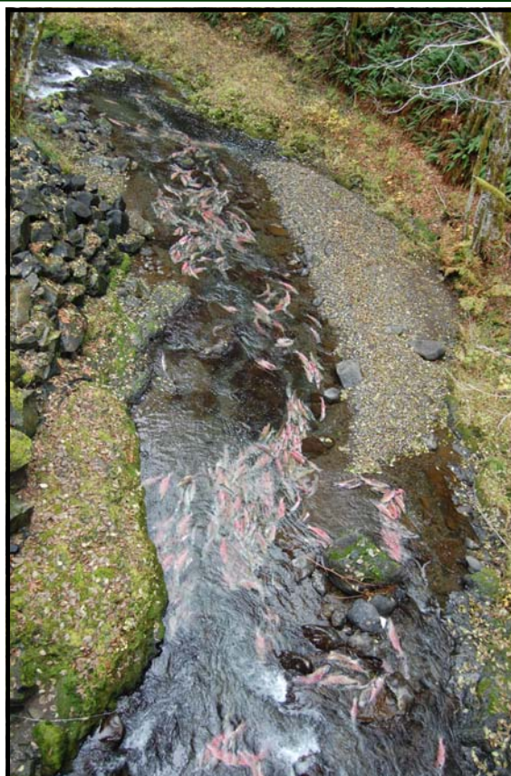
As part of the Satsop Nutrient Enhancement Project, this photo captures the 765 Coho carcasses planted at Baker Creek on Nov. 8, 2007. Baker Creek is a tributary to the Middle Fork Satsop River.

Over the past ten years, projects sponsored by the Chehalis Basin Fisheries Task Force have produced over 11 million salmonids (11,042,814 to be exact), and opened 67.25 miles of habitat for these anadromous species and other species that live in the waters of the Chehalis Basin. Breaking out the successes of the current year, projects sponsored by the CBFTF released 1,143,900 salmonids into various tributaries of the Chehalis River. In addition to this, the Task Force has completed three carefully planned habitat enhancement projects that cumulatively opened 8.44 miles of habitat for salmonids, resident fish, and other aquatic life. See the back of this page for a project accomplishment table, which illustrates the individual products produced when volunteers and stakeholders alike come together for the betterment of our local fisheries resources.