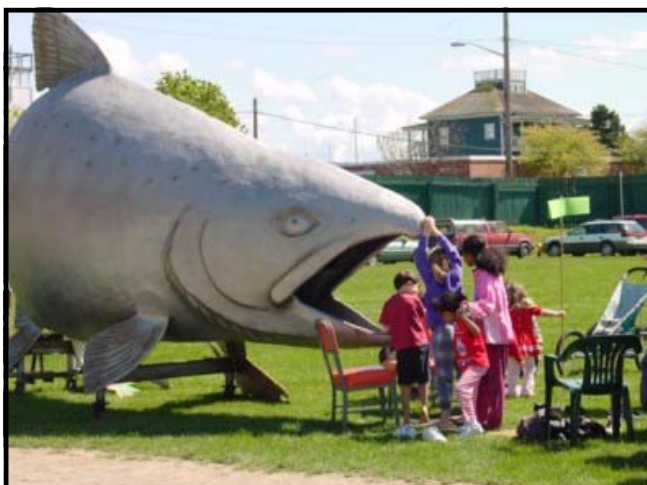
Fin the Migrating Salmon is pictured above.

Vendors and those interested in participating at the festival can contact Chanele Holbrook-Shaw at 360-264-7777.